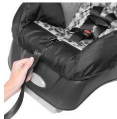
Upright Harness Adjust